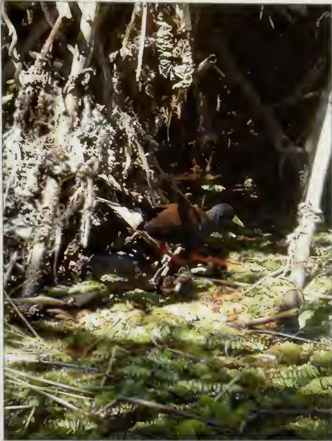
Figure 1. Adult Sakalava Rail / Râle d'Olivier adulte Amaurornis olivieri , Lac Ampandra, Madagascar, November 2002 (Iain Robertson)